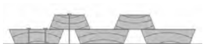
Figure 1 (Board & Batten in cross section)

Virtual sample attached files of the profile are available on the Radial website www.radialtimbers.com.au