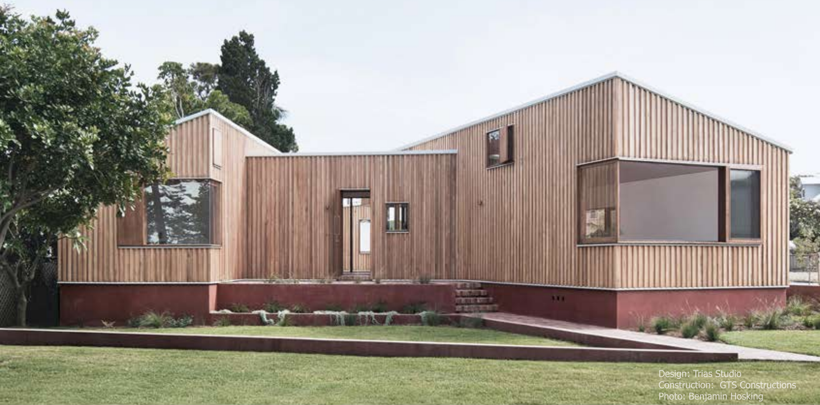
Design: Trias Studio Construction: GTS Constructions

Radial Timber Board and Batten is a unique alternative to traditional horizontal cladding systems. The layered boards are inspired by the old pailing fence look which provides a distinctive linear effect giving the style a beautiful modern twist.