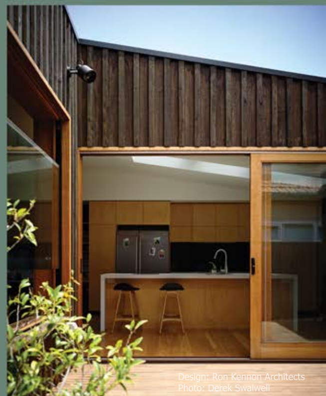
Design: Ron-Kennon Architects

Radial Timber Board and Batten can be used in Bushfire prone areas up to BAL 29 depending on the species.