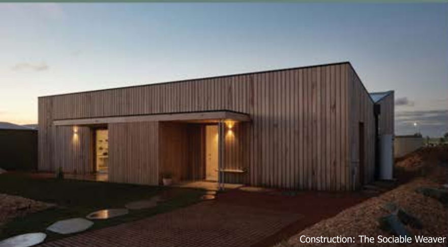
Construction: The Sociable Weaver