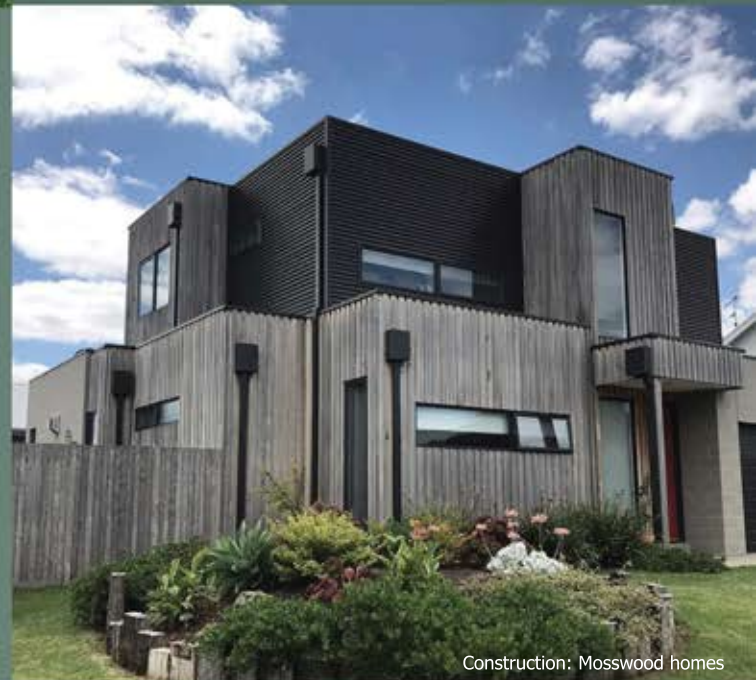
Construction: Mosswood homes