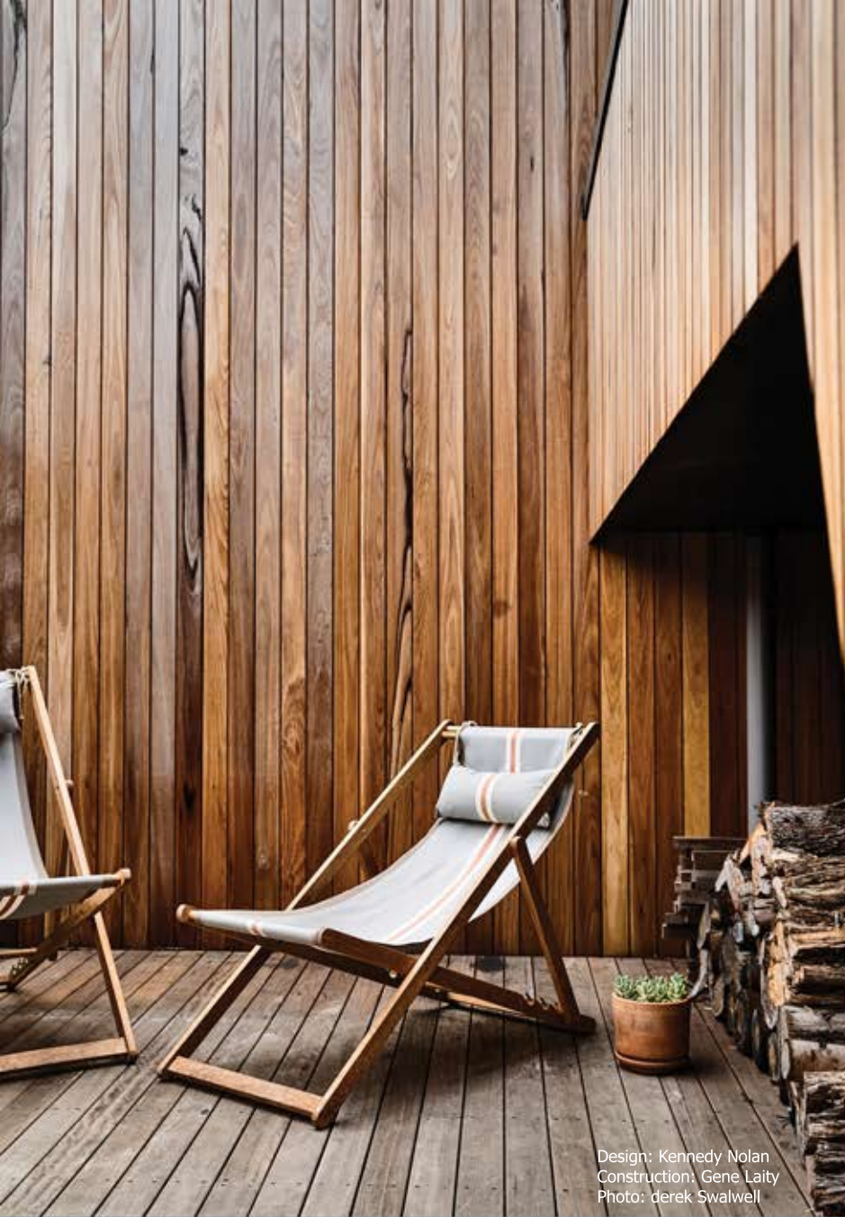
Design: Kennedy Nolan Construction: Gene Laity