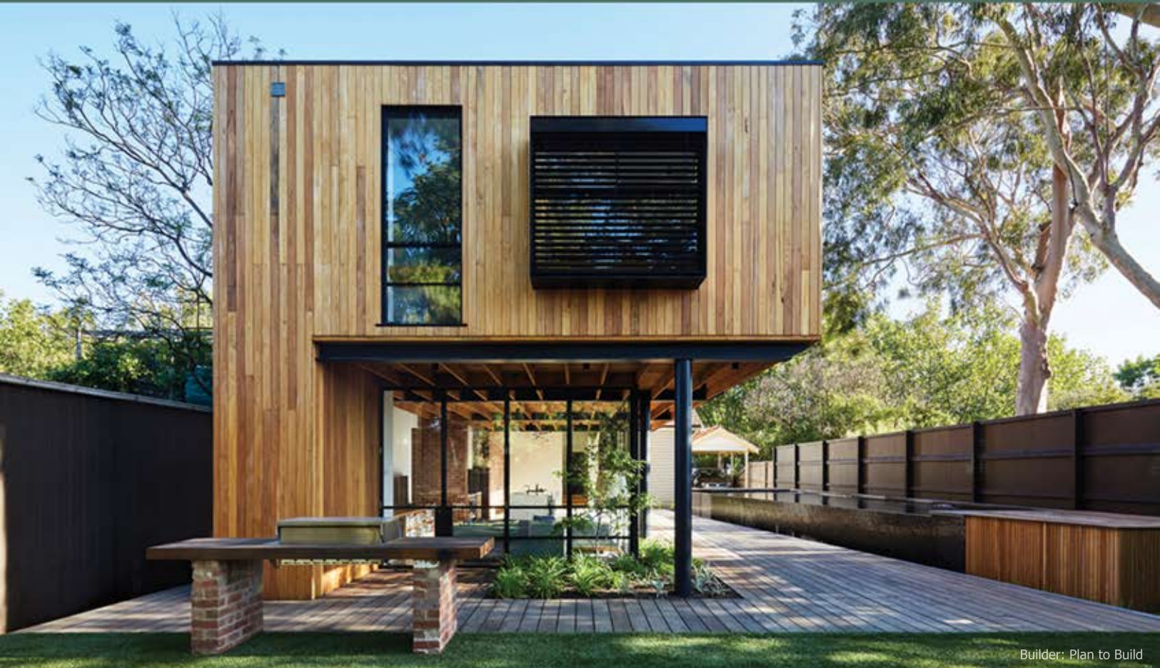
Builder: Plan to Build

Radial Timber Exterior Shiplap Cladding boards are a striking and modern way to finish off the exterior of commercial and domestic buildings.