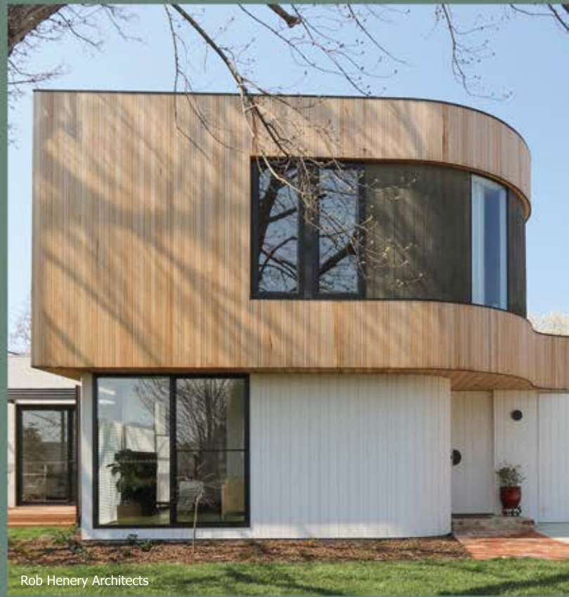
Rob Henery Architects

Exterior Timber Cladding is a timeless finish with a range of options to suit every design. Whether its a clean modern look or a beautifully rustic and weathered finish, Radial Timber exterior cladding is a sustainable choice.