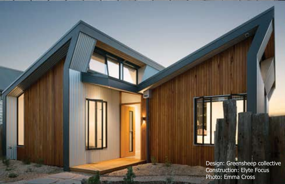
Design: Greensheep collective Construction: Elyte Focus