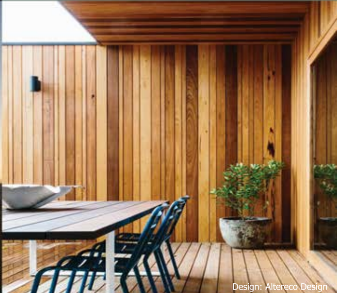
Design: Altereco Design

We have a range of different sizes, styles and finishes to suit any job. Give our friendly staff a call to go through your next project, or come into our showroom to have a look at our displays. You can also pick up some samples or order them directly through the Radial Timber Website.